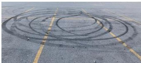
ESPD Banned Donuts.