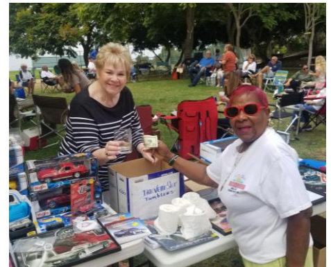
Treasures laid out on blankets and tables.