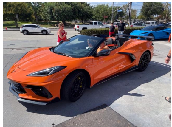
Pam and Dave with their new C8.

On Thursday, September 1, 2022, Pam and Dave were voted in as new members of the Vette Set. Three days later, they accepted the home delivery of their 2023 2LT hard top convertible with carbon flash top, ground effects, a high wing, and 2 spoke high gloss rims. This car has a black interior with orange seatbelts. The exterior color is Amplify Orange with tinted windows.