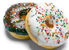
ESPD Approved Donuts.

On a positive note, these guys were tough enough to get up very early on Saturday morning, showing up at 4:50 am at Farmer Boys to get in line for the car show. They were not the first, but ended up being 7th, ahead of over 300 other cars. The weather was nearly perfect at 70 degrees and over cast for the morning with sun and warmer temps around noon. All in all a great time was had by everyone with so many beautiful cars to see.