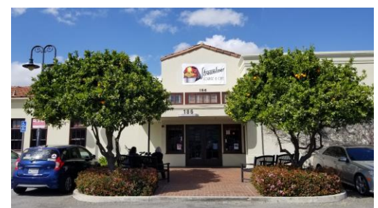
Lunch at the Streamliner Cafe.