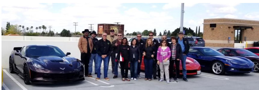
Up on the Roof. 🎵