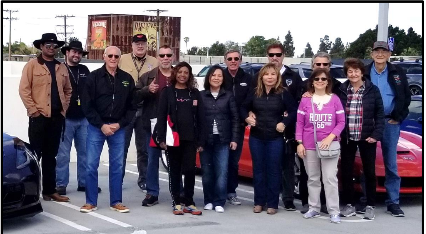
City of Orange Run