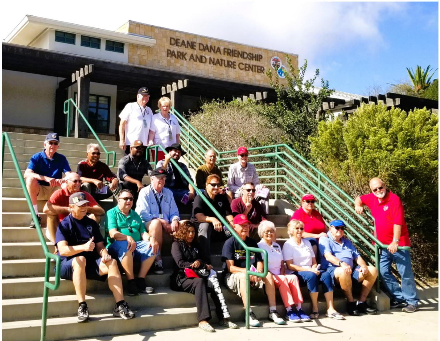
Group photo before departure.

Heading for home. We left the park through a residential area, returned to 25 th Street, on to PV Drive South to PV Drive East up the switchbacks and headed for home. In my case, I went up the switchbacks, turned around and went home.