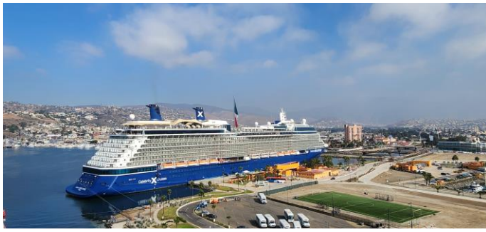
Ours was not the only ship in Ensenada.