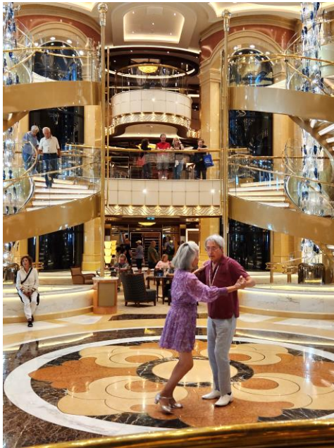
Dancing Queen & King.