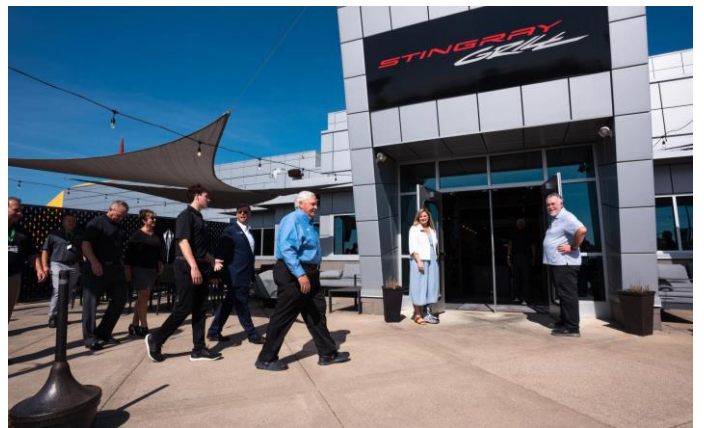
Rick Hendrick at Stingray Grill.

Nation of Speed Opens at the National Air and Space Museum Nation of Speed, a new exhibit at the National Air and Space Museum, recounts our desire to become the fastest on land, sea, air, and space in the pursuit of commerce, power, and prestige. This exhibit showcases a 1959 Chevy Corvette, on loan from the National Corvette Museum .