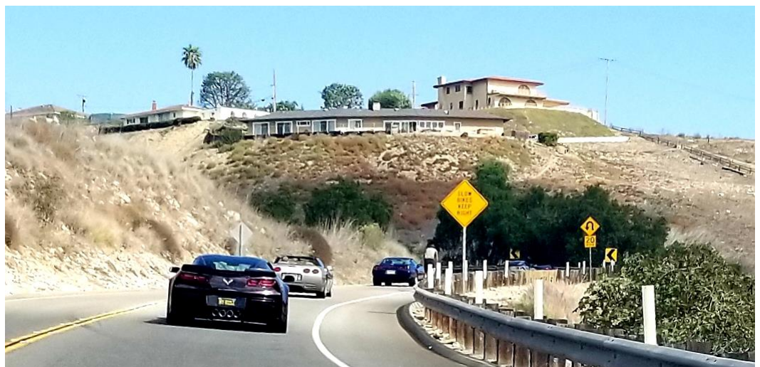
Heading for home via the switchbacks on PV Drive East.

Heading for home. We left the park through a residential area, returned to 25 th Street, on to PV Drive South to PV Drive East up the switchbacks and headed for home. In my case, I went up the switchbacks, turned around and went home.