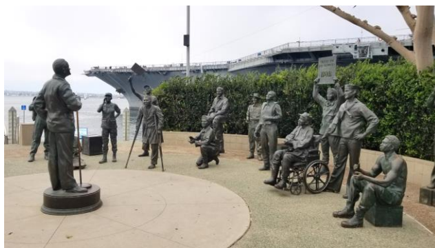
National Salute to Bob Hope and the Military.