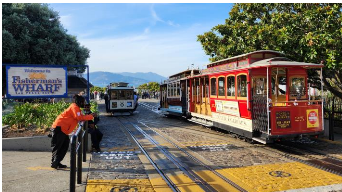
Cable cars near Ghirardelli.