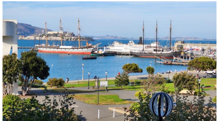
Views from the Square.