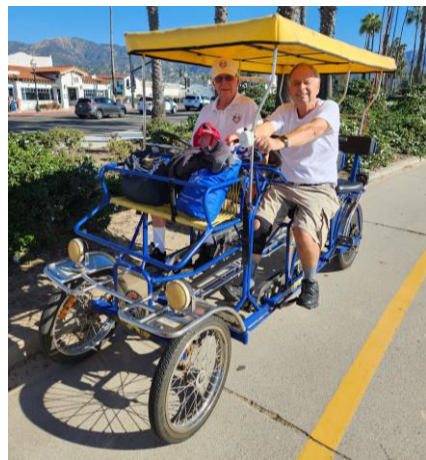
The C Team