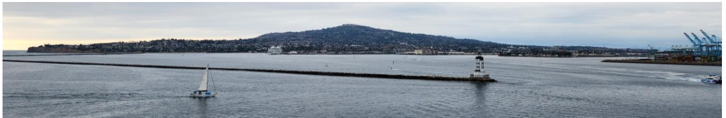
The PV Peninsula with Angel's Gate Lighthouse in the foreground.

Oct. 15, Los Angeles. After boarding the ship, luggage was delivered to our rooms and we were provided with the location of our life jackets and our muster station in the case of an emergency. As we exited the harbor, we said good bye to the Palos Verdes Peninsula. With a maximum elevation of 1,457 ft, PV can offer commanding views of the surroundings. As we departed, a view of the peninsula was somewhat anti-climatic. From a distance, it only looks like a minor protrusion of the earth surface.