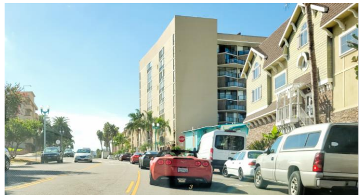
Redondo Beach: Wyland's Gray Whale Migration" on AES Power Plant.