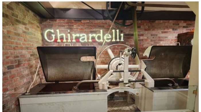
A Willy Wonka-esque machine.