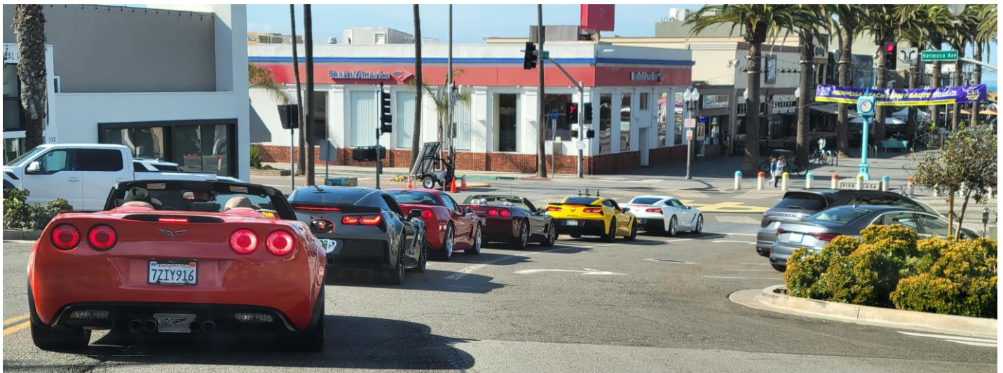
On Pier Avenue before turning left on Hermosa Avenue.

1 st Stop. Torrance Beach. We left the museum and drove south on PCH before turning west on Pier Avenue in Hermosa Beach. We turned south on Hermosa Avenue which became N. Harbor Drive in Redondo Beach. There we drove by the former Ruby's Diner, the location of many car shows and breakfasts. From there we went south on Catalina Avenue, passing the Redondo Beach Pier and turned west to take the Esplanade south to Torrance Beach.