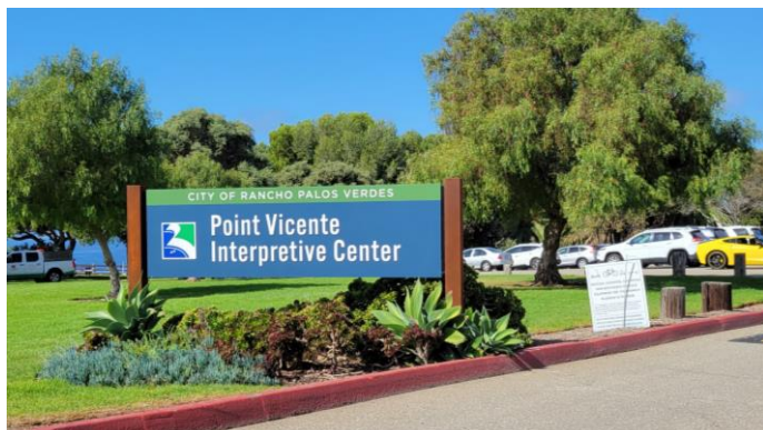
Pt. Vicente Entrance.