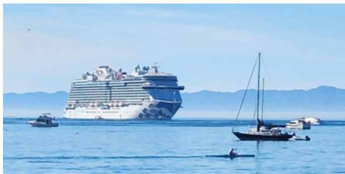
Our ship with Channel Islands.