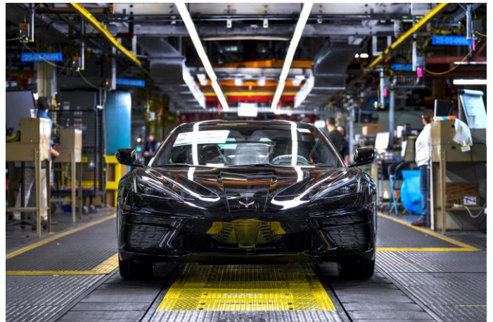
Plant Tours are Coming Back.

Plant Tours are Coming Back! Tours will go on sale to the public on Tuesday, November 1, 2022. National Corvette Museum members qualify for early booking access, beginning on Tuesday, October 25, 2022. Tour scheduling will take place at the time of purchase. At this time, tours can only be booked through the end of January 2023. For a list of current blackout dates, please contact the Museum. Members can schedule and purchase plant tours by logging into their Members Only Portal.