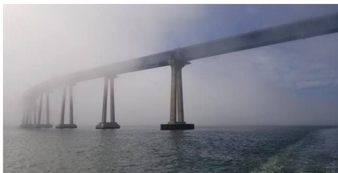
The harbor cruise started out sunny, but turned foggy.