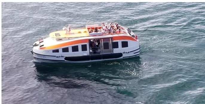
Shuttle boats took us ashore.