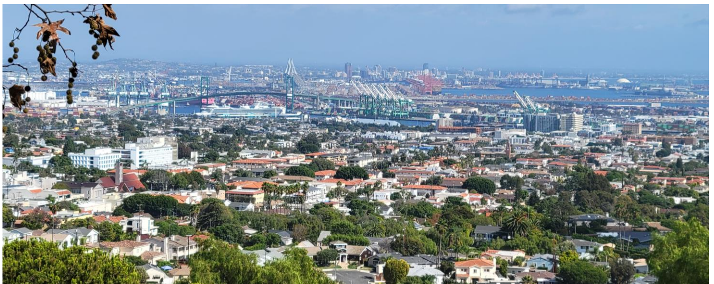
And a tremendous view overlooking the harbors.

[Editor’s note. I have lived in this area since 1977 and have never visited Friendship Park and was quite surprised by the facility.]