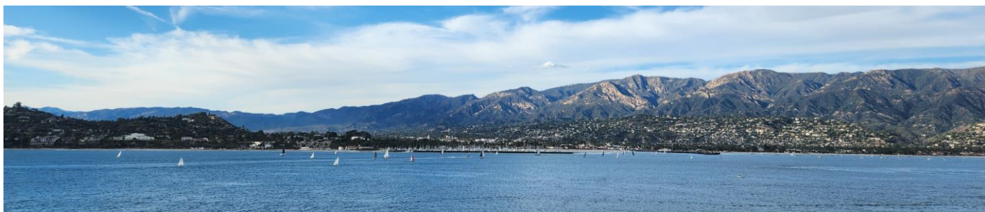
View of Santa Barbara from the ship.

Oct. 19, Santa Barbara. In the morning, we arrived in Santa Barbara. We were taken ashore in boats, carried on the ship, each holding approximately 200 passengers. Our plan, was to rent 4-wheel, 4-passenger, surrey bikes powered by us (using pedals). We went along a paved path along the beach and discovered minor uphill inclines to be a challenge. Next time? Work out before the trip or rent powered vehicles.