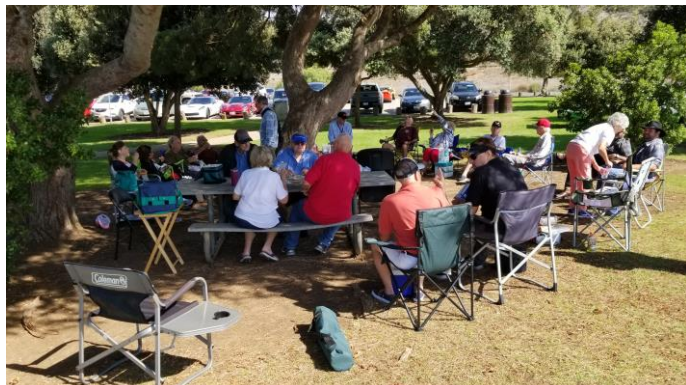
A picnic in the shade.