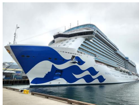
“Our” ship, Princess Discovery.