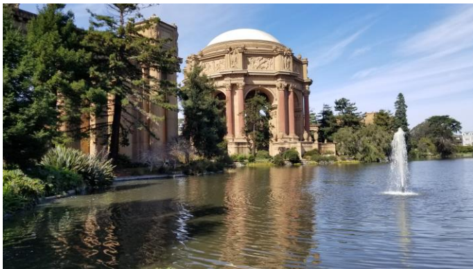
Palace of Fine Arts.