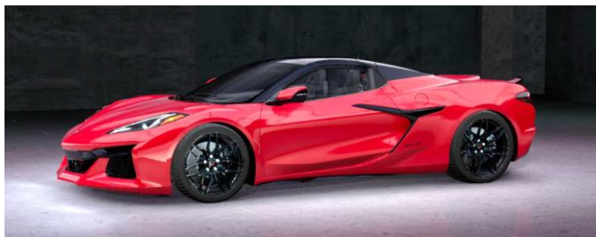
2023 Red Mist Corvette Z06 Convertible Drawing Thur., Dec. 15, 2022 at 2pm CT Tickets $350 | Limited to 2,500 Tickets