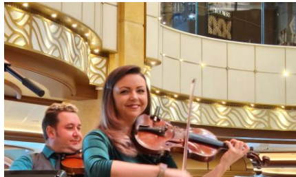
Violinists from Ukraine