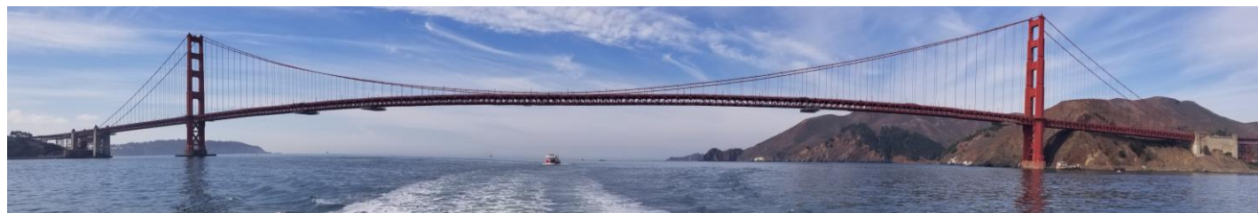
Golden Gate Bridge as viewed from Harbor Cruise.