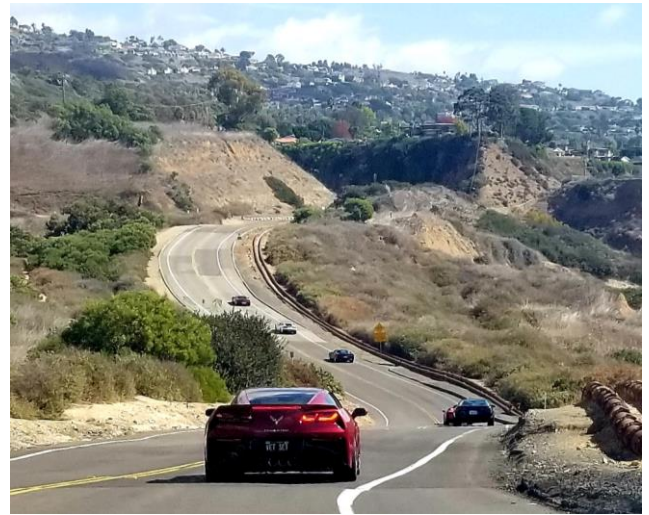
The Portuguese Bend “rollercoaster.”