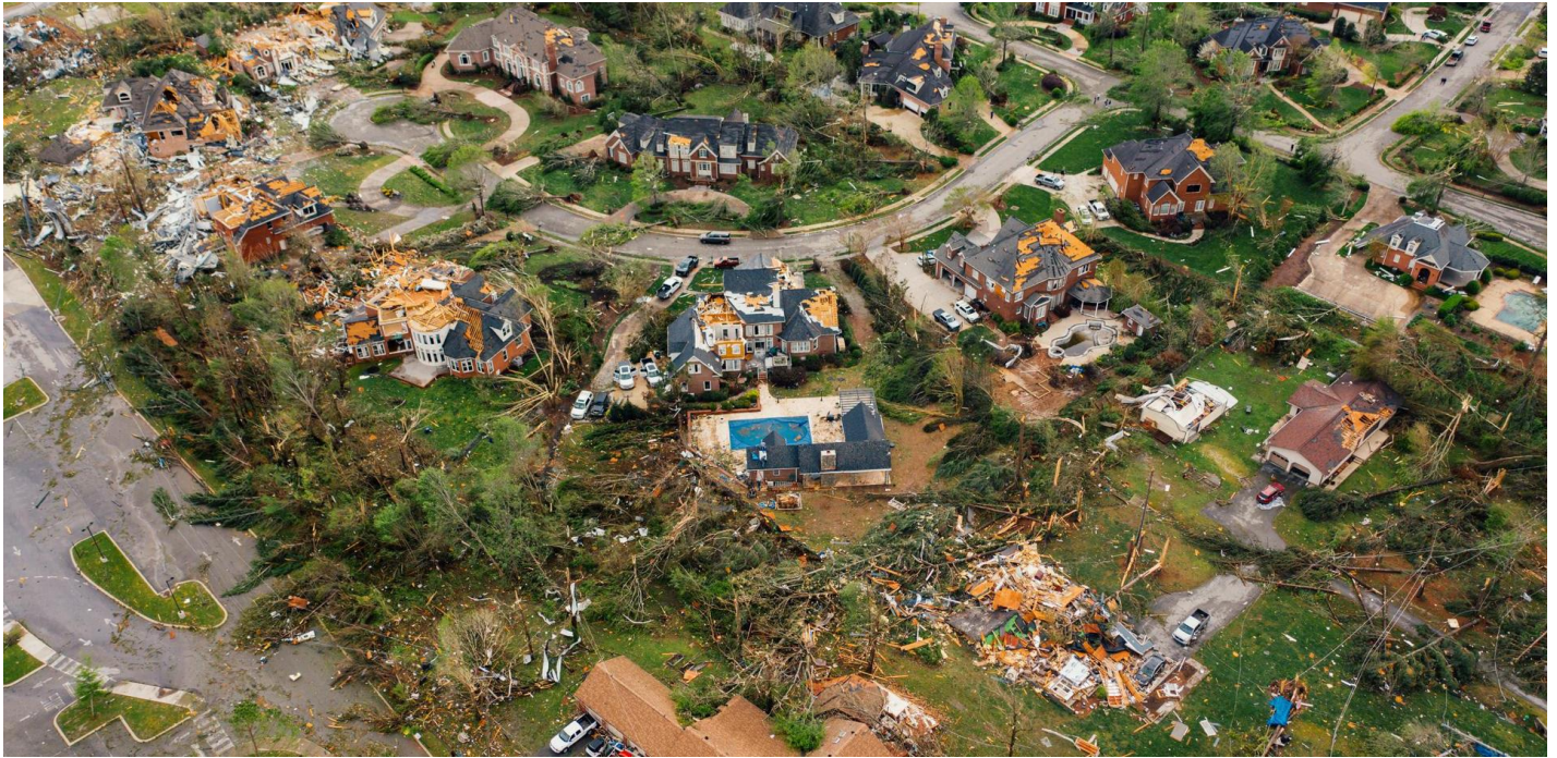
Aerial View of Disaster.

South of Ft. Meyers, found his 1994 Corvette sitting in 17 inches of water in the garage a day after the Hurricane struck. He immediately filed a claim with them the next day. Thomas and his claims adjuster worked together and decided it was in his best interest to total the vehicle out. 7 days later he had a check for $20,000 in his hand ready to shop for the next Corvette!