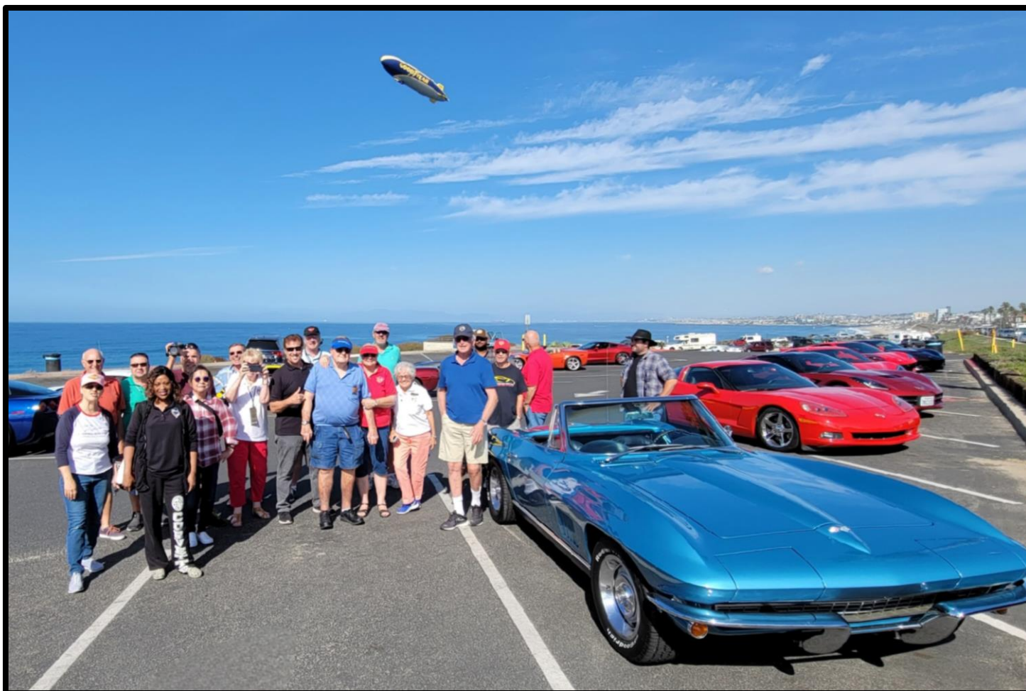
Group Photo at Torrance Beach Harry's "Hugging the Coast Run"