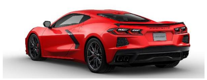
2023 Torch Red Corvette Coupe Drawing Friday, Dec. 16, 2022 at 2pm CT Tickets $100 | Limited to 2,000 Tickets