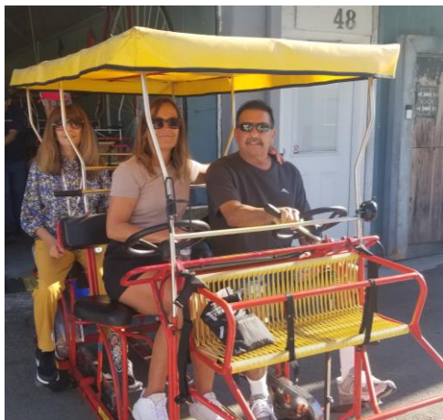
The A Team (fastest)