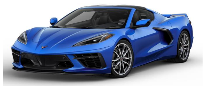
2023 Elkhart Lake Blue Corvette Coupe Drawing Thursday, Dec. 1, 2022 at 2pm CT Tickets $150 | Limited to 1,500 Tickets