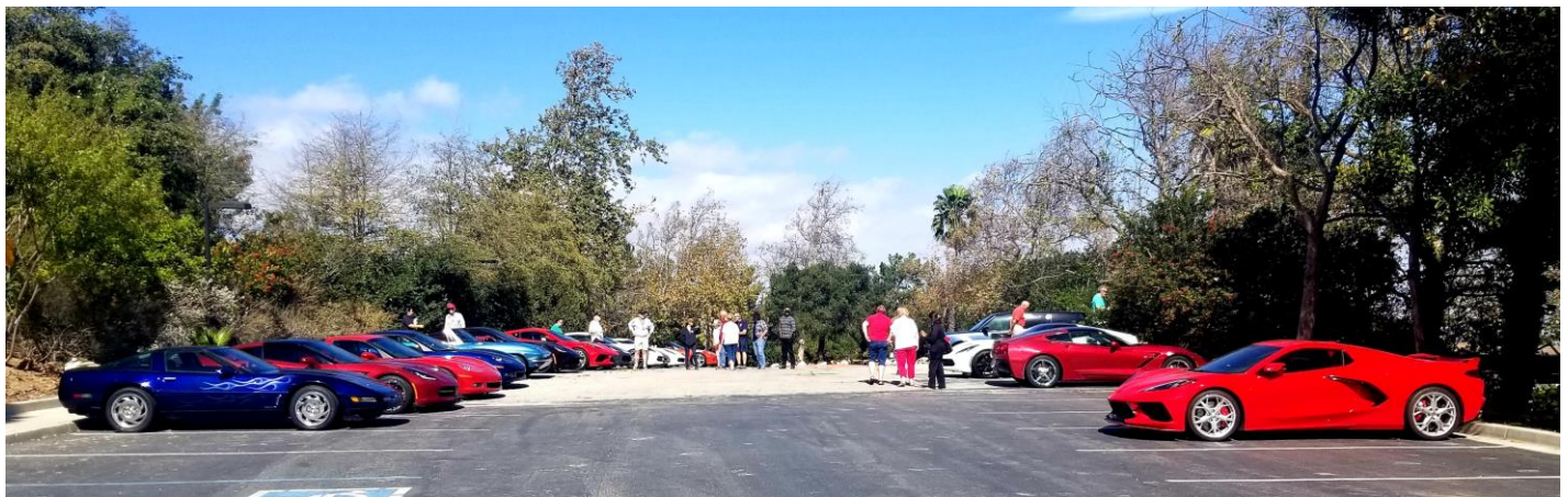
There was ample parking at the Friendship Park.