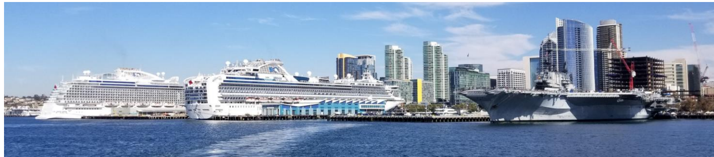
Downtown San Diego with Princess Discovery, Princess Sapphire and USS Midway in foreground.

Oct. 20, San Diego. In the morning, we came into the harbor. The route past the Navy ships was impressive as was the view of the port and downtown San Diego. Sharon signed up for another harbor cruise, which was cut short because the fog was coming in. We cut the cruise in half and elected to explore the harbor area on foot.