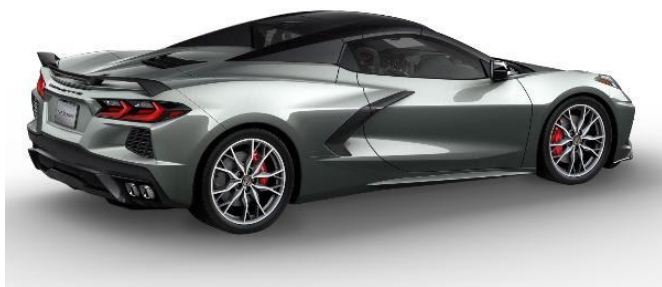
2023 Hypersonic Gray Corvette Convertible Drawing Thursday, Nov. 10, 2022 at 2pm CT Tickets $200 | Limited to 1,500 Tickets