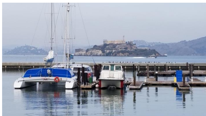
Alcatraz viewed from the port.