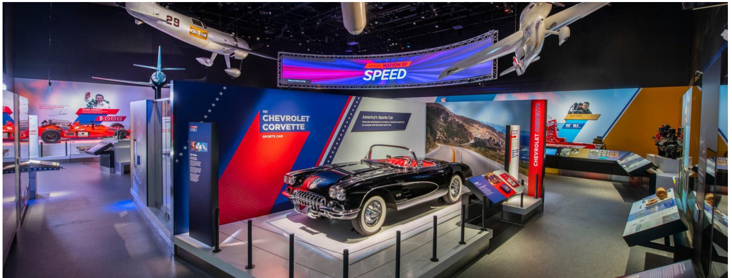
“Nation of Speed” Exhibit at National Air and Space Museum.

Nation of Speed Opens at the National Air and Space Museum Nation of Speed, a new exhibit at the National Air and Space Museum, recounts our desire to become the fastest on land, sea, air, and space in the pursuit of commerce, power, and prestige. This exhibit showcases a 1959 Chevy Corvette, on loan from the National Corvette Museum .