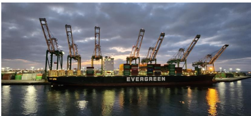
October 22, Saturday. Back home in LA Harbor.