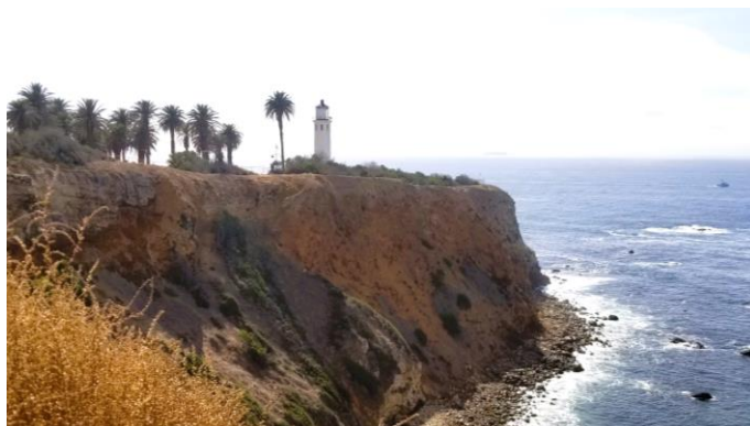
Pt Vicente lighthouse.