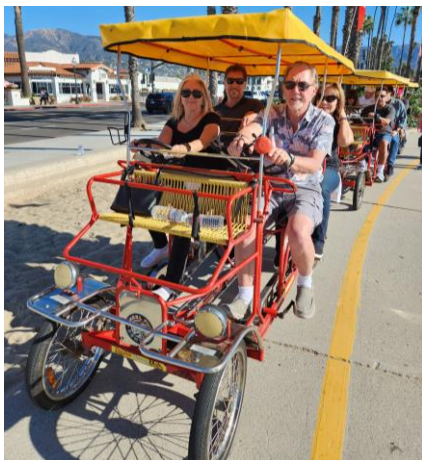
The B Team (next fastest)