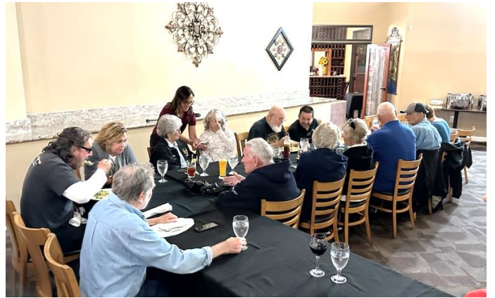
Lunch at Gino's Ristorante in Lancaster