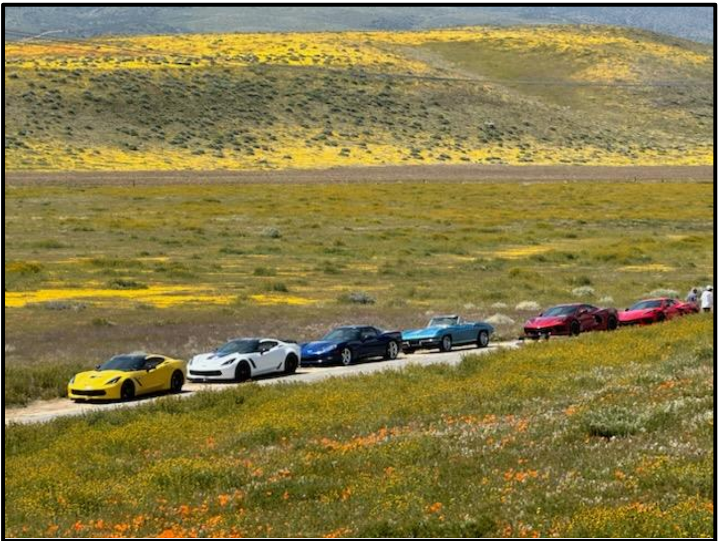
California Poppy Reserve Run