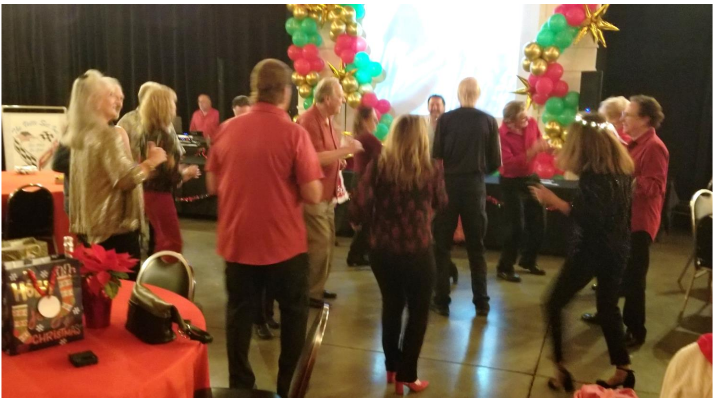
After the dinner and presentations, a dance broke out at the event