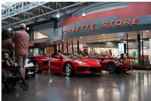
2023 Delivery Wrapup

Here is your chance to see Corvette Racing against the worlds best GT cars in the most famous race of all. Just a few highlights of the tour include stops in Paris, Normandy, and of course Le Circuit de la Sarthe {Le Mans Track). They will have professional guides with them during the entire trip to assist with your travels.