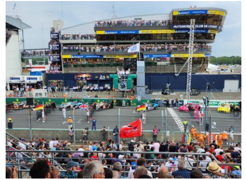
MiM Le Mans Tour