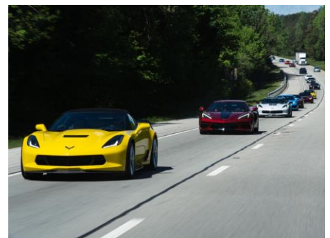
2024 Corvette Caravan

August 29-31 2024 Corvette Caravan and 30th Anniversary Celebration