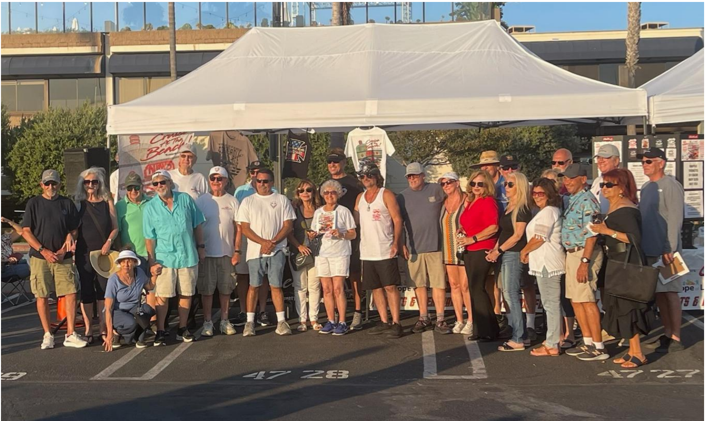
TVS group photo was taken at the 25th Anniversary of Boyd's Cruise at the Beach