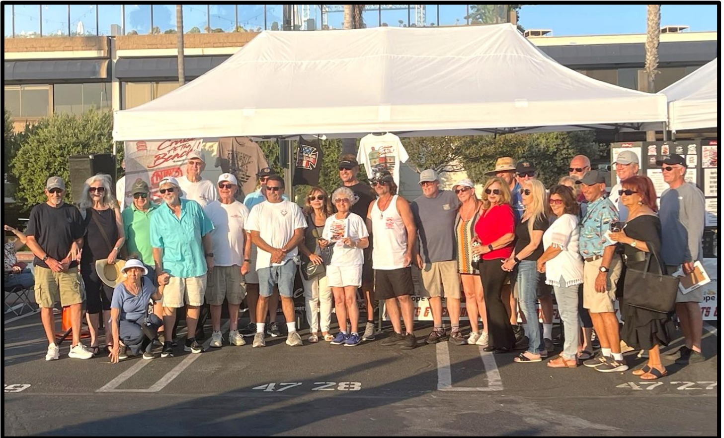
Vette Set Members at “Boyd’s Cruise at the Beach” Car Show